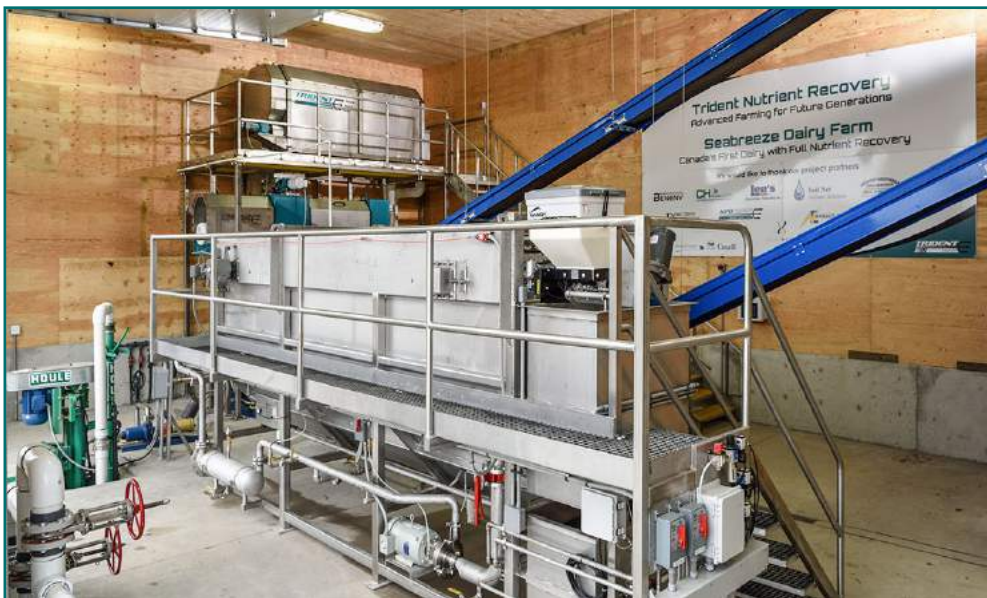
Nutrient Recovery on Seabreeze Farm 300-cow Dairy, Delta, BC.