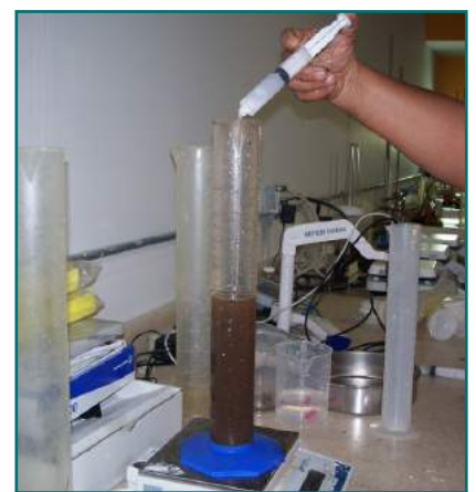
Lab testing polymer formulations for the nutrient recovery process.

Trident continues to develop its technology through strategic partnerships including: process engineers, ag-scientists, equipment dealers and the farmers themselves. We are a key partner in a major nutrient recovery study administered by the University of Wisconsin and funded by the USDA the results of which validated the process and from which the primary system design originates.